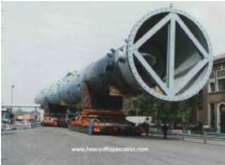
Transport & shipment of a 93 m long and 725 ton heavy CO2 splitter from Pt. Marghera, Italy to the Qatum Refinery in Houston, USA.