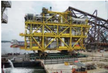
Load-out of two compression modules (1750 Ts + 1865 Ts) for Shell / Petronas Malaysia