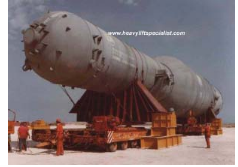
Transport and lifting work for Saudi Aramco